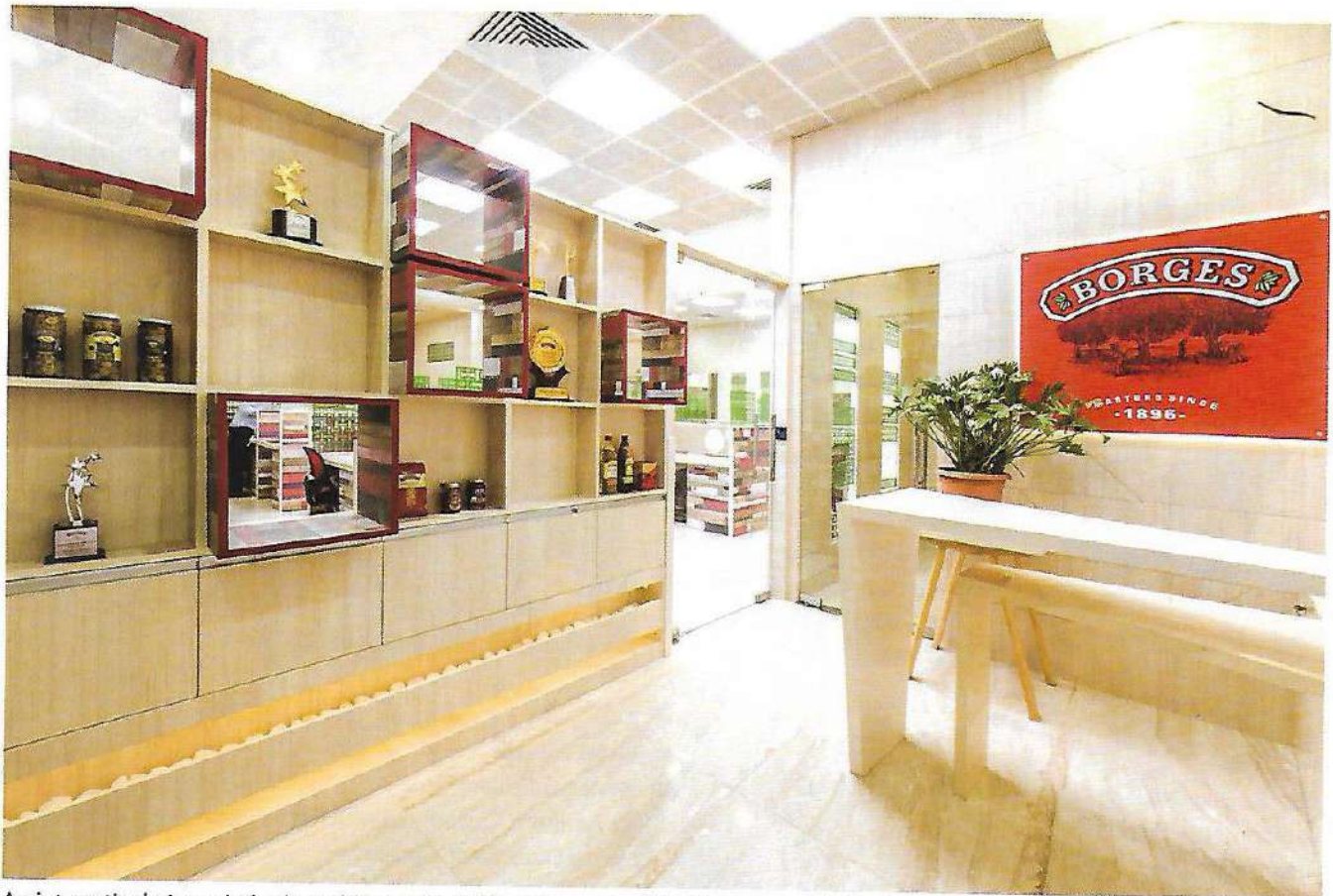
An interestingly irregularly shaped Reception table composed with a few trapezoidal surfaces and as its backdrop, the logo of the company in bright red