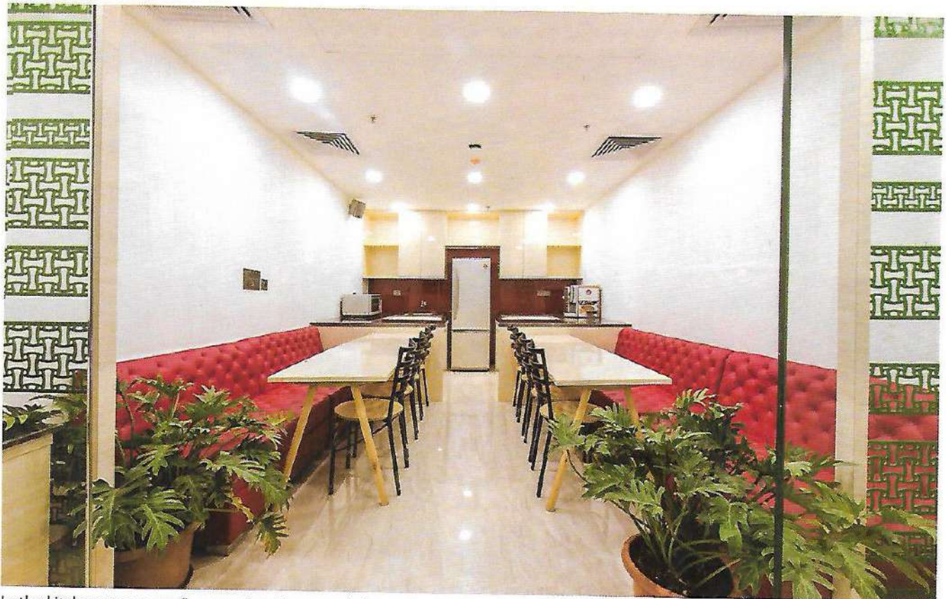
In the kitchen area, a confluence of red lacquered glass as backsplash, beige laminate shutters on overhead storage, bright red fixed leather upholstered seats in the dining area complement each other