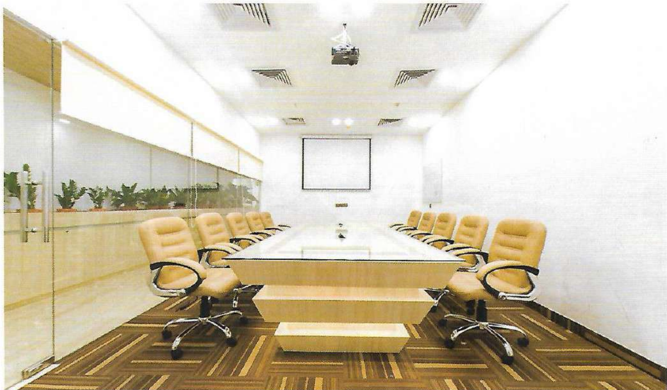
While most of the areas have Italian Diana Flooring or wooden laminate flooring, in the conference room the dark carpet flooring adds drama and gives a sense of transition from the rest of the office area