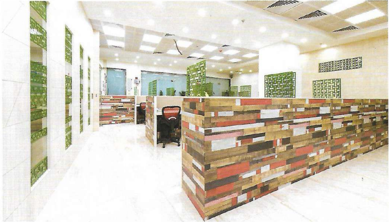
At the workstations materials have been kept simple and elegant with neutral beige and off-white offset by a bit of red and green

The design approach of Studio An-V-Thot Architects in the office renovation of Borges India has been to serve the best office ambience keeping the brand identity in mind